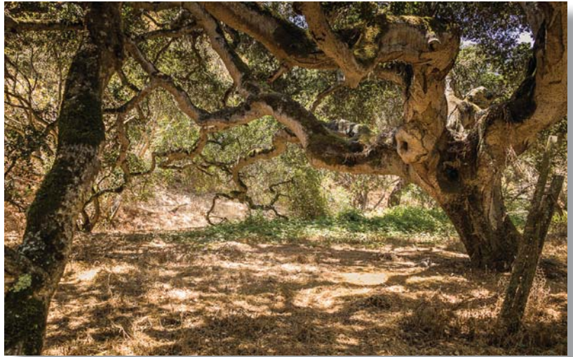
Old Oaks Nicole Asselborn