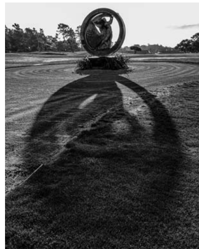
The Golf Swing, Dale Thies