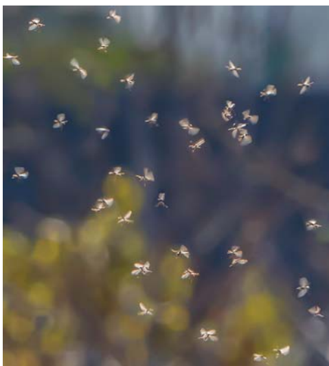
Tiny Flying Insects, Amy Sibiga