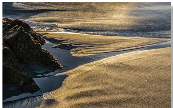
View in Late Afternoon Light, Janet Azevedo