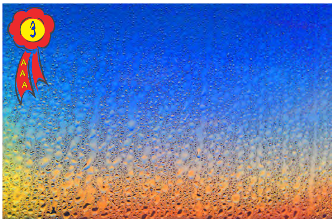
Sunset Through the Window

A pleasing juxtaposition of colors and shapes ... of focus and intensity. The red border may be a bit too cropped.