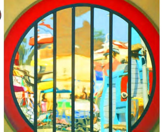
Window on Santa Cruz Boardwalk

A pleasing juxtaposition of colors and shapes ... of focus and intensity. The red border may be a bit too cropped.