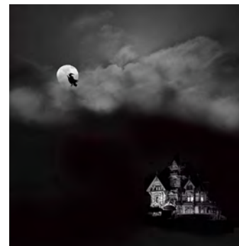
The Witch and the Haunted House

Nice blending of images and use of light to achieve the desired mood.