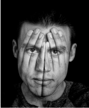
See no evil

Superb technical as well as powerful artistic statement. Very nice blending of images. Perhaps the title should be "Sees all evil"?