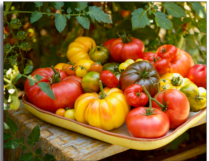
Tomato Platter