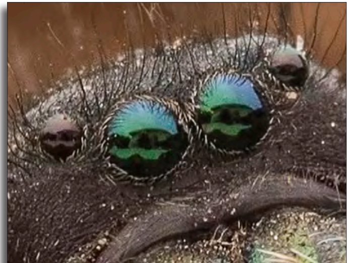
Jumping Spider

is an extreme closeup of his eyes, where you can see the reflection of the back of my house! After I was done, I put him back down and he went on his merry way.