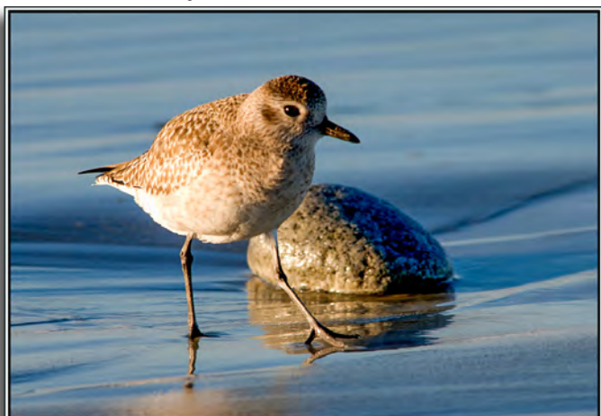
Rock and Shore Bird

This truly is one of my favorite images. It was taken at Asilomar State Beach at almost 2 o'clock in the afternoon on the day after Christmas, 2007. I love the complementary shapes, colors, textures and relative size of the rock and the body of the sandpiper, the motion in his stride and the softness of the wet sand and receding surf. It was taken with a Nikon D300 with a 80-400mm f/4.5-5.6 lens, all the way out to 400mm. With an ISO setting of 200 and aperture priority, it was shot at f/9 1/320th of a second. However, I wasn't thinking about any of that when I saw the little guy walking along the water's edge. I plopped down on a knee and started pressing the shutter. This image is one I printed for PTCC's Monterey County, Naturally exhibition at the PG Museum of Natural History in January, 2008. I'm glad I did. On opening night, I noticed an elderly woman looking at the print and smiling. When I approached her and introduced myself, she told me she was happy because she had always loved sandpipers but that she'd lost much of her sight and couldn't see them on the beach anymore.