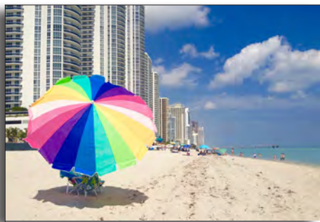
Sunny Isles Beach - Cath Tandler-Valencia

of that sliding cylindrical stick that sealed the images. As a kid she had a Brownie with a flash, then a Minox, then a Canon TL QL. In college she took a class in B&W photography, learning how to develop images