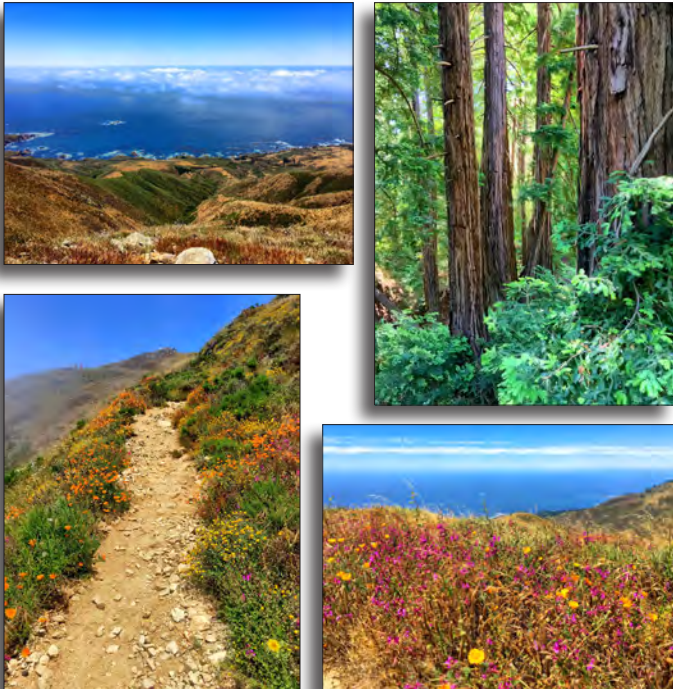
Rocky Ridge and Soberanes Canyon