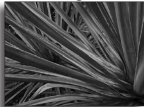
Left, as shot. Right converted to B&W.